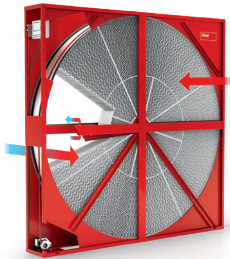
Viskan: High efficiency and low pressure drop with a wide range of models available.

All aspects of the Viskan series have been newly developed and the series covers a wide efficiency range. It is suitable for all kinds of applications with a large portfolio of sizes and wave heights.